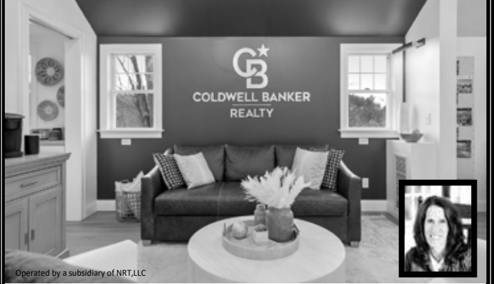
Operated by a subsidiary of NRT, LLC