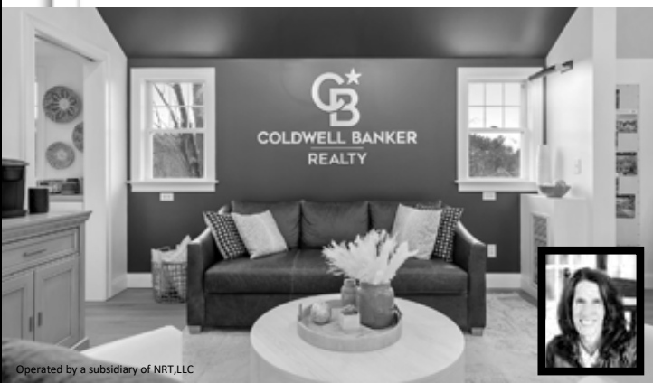
Operated by a subsidiary of NRT, LLC