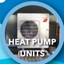
HEAT PUMP UNITS