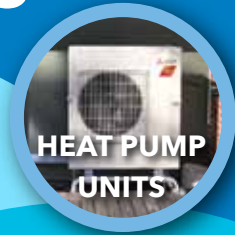
HEAT PUMP UNITS